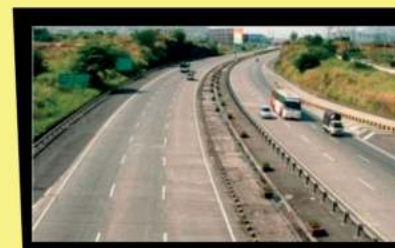
Chennai to Bangalore Highway