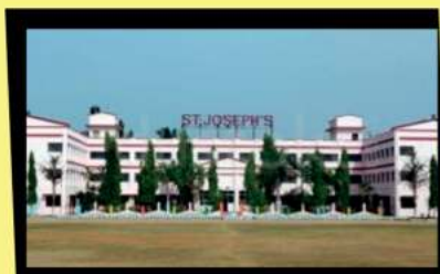
St.Joseph's Residential School