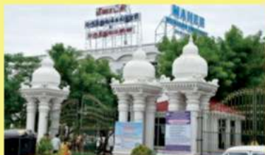
Meenakshi Medical College & Hospital