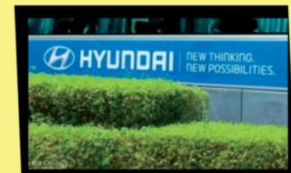
Hyundai Manufacturing Unit