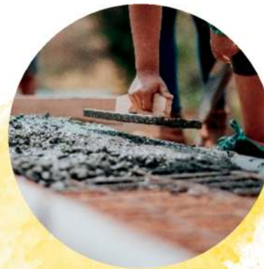
READY FOR CONSTRUCTION