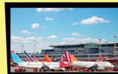
Proposed Green Field Airport