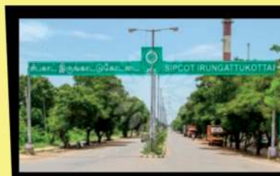
SIPCOT Industrial Estate