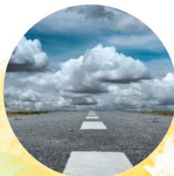
ELEVATED BLACK TOP ROADS