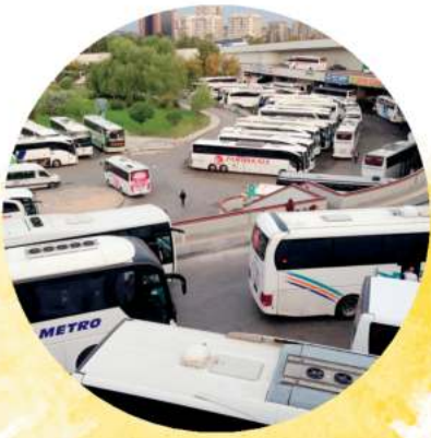
NEW BUS TERMINUS